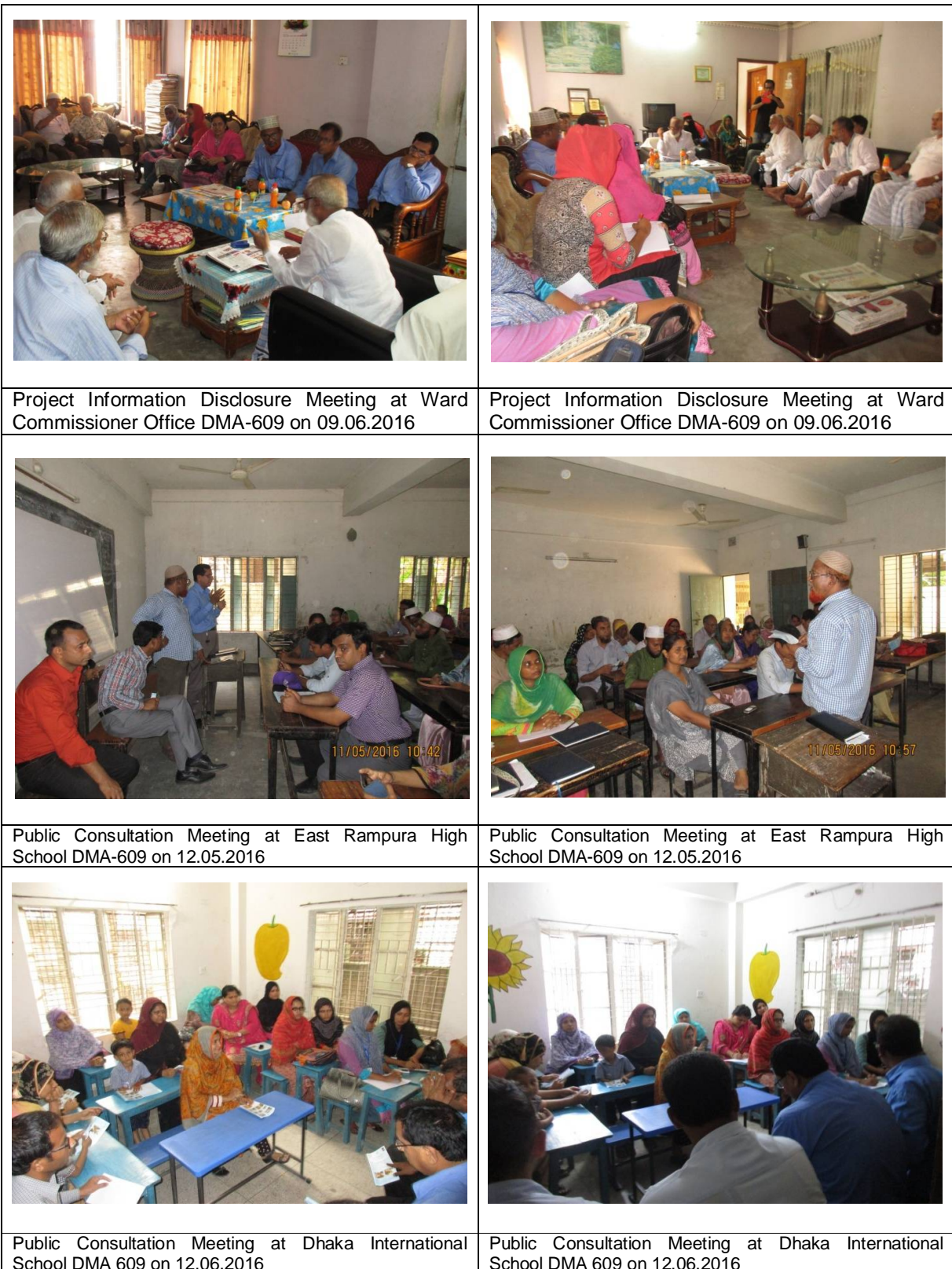
Photo Gallery of DMA - 609